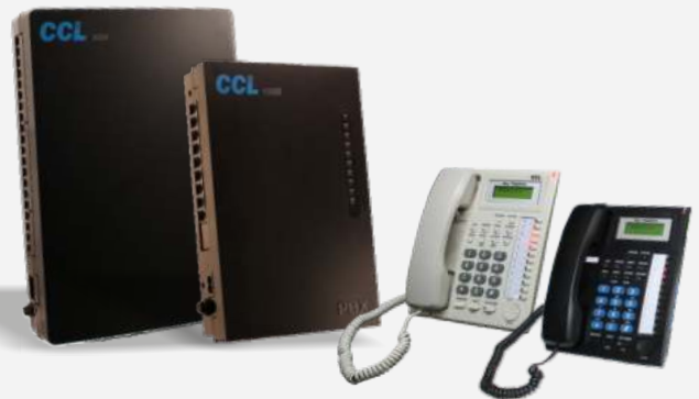
Models from 4 to 500 Extensions