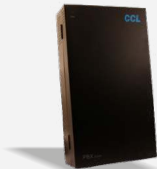
X-Series : 832X & 8120X

Designed, Developed & Manufactured in India